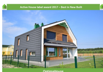
OptimaHouse Diploma on Best in New Built