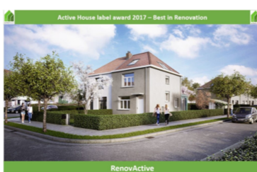
RenovActive Diploma on Best in Renovation