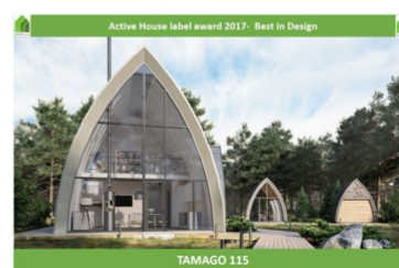
Tamago 115 Jury recommendations in Best in design