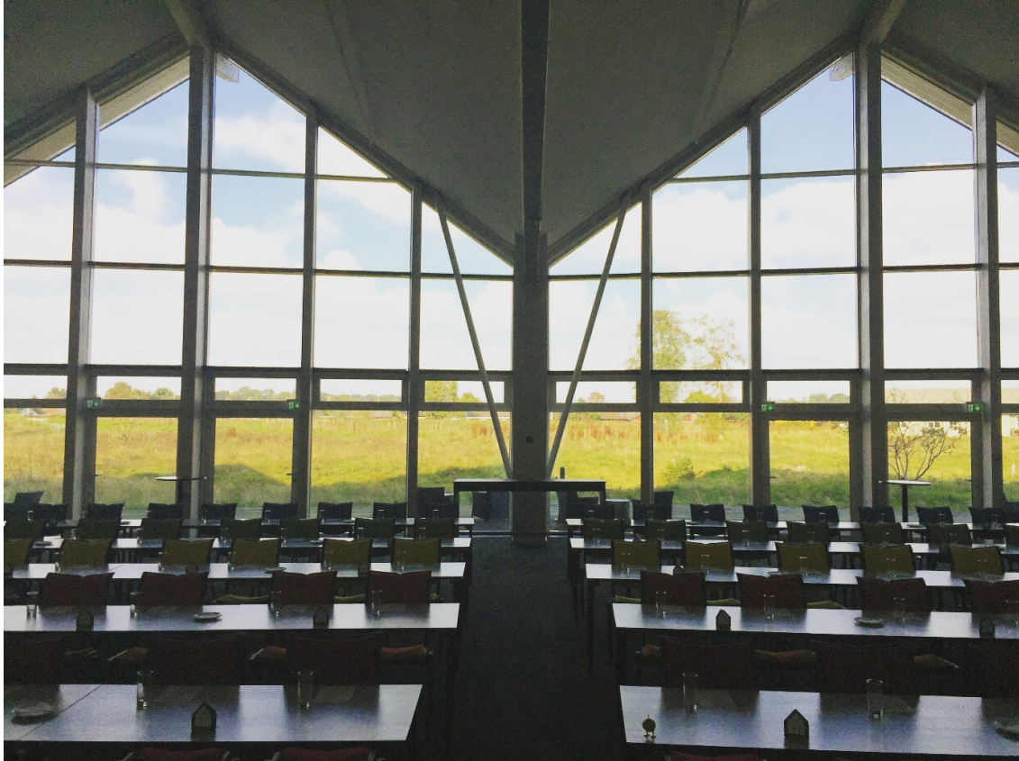
Green Solution House