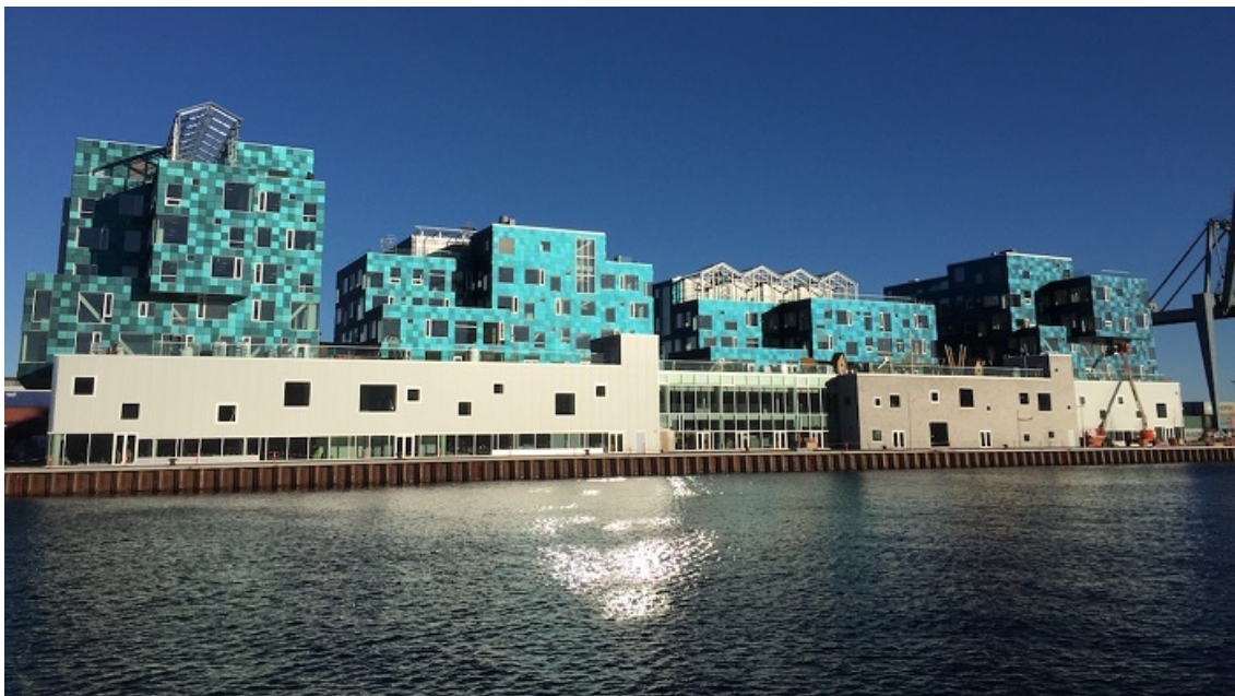
International School of Copenhagen